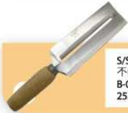
S/S Cane Peeler 不銹鋼蔗削 B-03-091-060-0 25.5cm