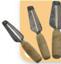
Peeler 瓜削 a B-03-091-101-H 19cm b B-03-091-102-H 18cm c B-03-091-103-H 15.5cm