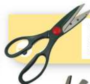
Kitchen Scissors 廚剪 B-03-070-000-0 21.5cm