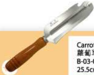
Carrot Peeler 蘿蔔單片削 B-03-091-080-0 25.5cm