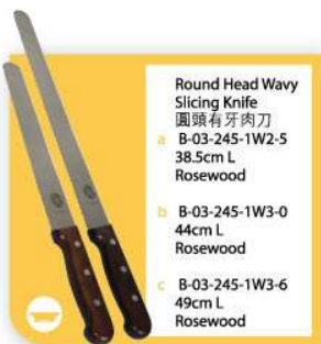
Round Head Wavy Slicing Knife 圓頭有牙肉刀 a B-03-245-1W2-5 38.5cm L Rosewood b B-03-245-1W3-0 44cm L Rosewood c B-03-245-1W3-6 49cm L Rosewood