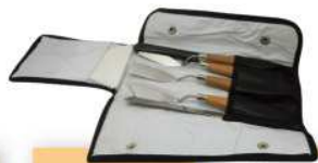
Vegetable Decorating Knife 精裝藝刀 B-03-064-070-0 7 pcs / set