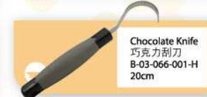
Chocolate Knife 巧克力刮刀 B-03-066-001-H 20cm