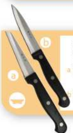
Straight Vegetable Carving Knife 直身雕花刀 B-03-064-002-0 19cm L B-03-064-003-0 19cm L