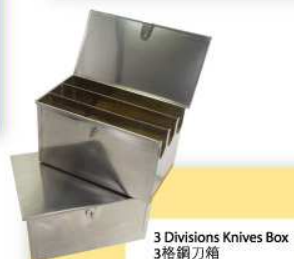
3 Divisions Knives Box 3格鋼刀箱 a B-03-200-030-0 25 x 13 x 15.5cm H