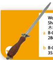
Wooden Handled Sharpening Steel 木柄磨刀棍 a B-03-190-111-0 28cm L b B-03-190-141-0 35.5cm L