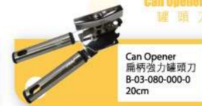
Can Opener 扁柄強力罐頭刀 B-03-080-000-0 20cm