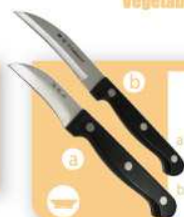
Curve Vegetable Carving Knife 彎形雕花刀 B-03-064-000-0 19cm L B-03-064-001-0 19cm L