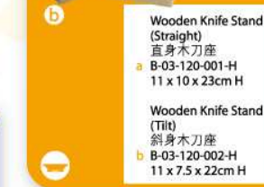
Wooden Knife Stand (Tilt) 斜身木刀座 b B-03-120-002-H 11 x 7.5 x 22cm H