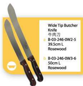
Wide Tip Butcher Knife 牛肉刀 a B-03-246-0W2-5 39.5cm L Rosewood b B-03-246-0W3-6 50cm L Rosewood