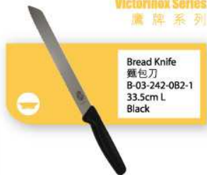
Bread Knife 麵包刀 B-03-242-0B2-1 33.5cm L Black