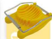
Egg Slicer 切蛋器 B-03-100-000-0 10 x 8cm