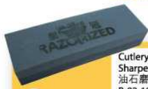
Cutlery Sharpening Stone 油石磨刀石 B-03-191-000-0 22.5 x 7.5 x 4cm H