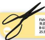
Fish Clamp 魚腮鉗 B-03-070-100-0 25.5cm