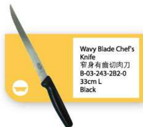
Wavy Blade Chef's Knife 窄身有齒切肉刀 B-03-243-2B2-0 33cm L Black