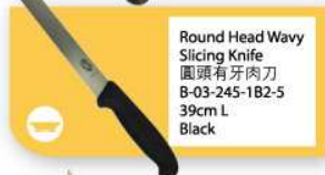
Round Head Wavy Slicing Knife 圓頭有牙肉刀 B-03-245-1B2-5 39cm L Black