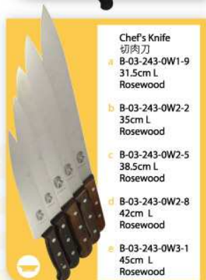
Chef's Knife 切肉刀 a B-03-243-0W1-9 31.5cm L Rosewood b B-03-243-0W2-2 35cm L Rosewood c B-03-243-0W2-5 38.5cm L Rosewood d B-03-243-0W2-8 42cm L Rosewood e B-03-243-0W3-1 45cm L Rosewood