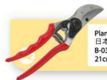
Plant Shears 日本樹枝剪 B-03-070-110-H 21cm