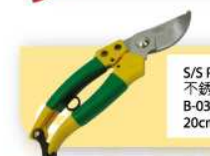
S/S Plant Shears 不銹鋼花剪 B-03-070-111-H 20cm