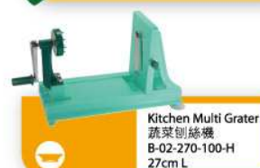
Kitchen Multi Grater 蔬菜刨絲機 B-02-270-100-H 27cm L