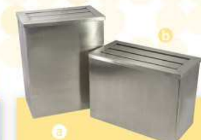
Stainless Steel Disinfection Knives Box 消毒刀箱 a B-03-200-001-H 31 x 15.5 x 23cm H b B-03-200-002-H 25.5 x 15.5 x 33cm H