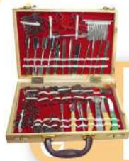
Vegetable Carving Knives Set 木盒雕花刀 B-03-064-800-0 33 x 23 x 5cm 80 pcs / box