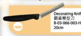
Decorating Knife 鋸齒擀型刀 B-03-066-003-H 20cm