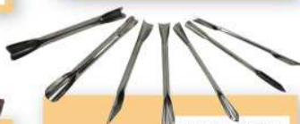
Vegetable Carving Knives Set 雕花刀 B-03-064-171-0 16.5cm 7 pcs / pack