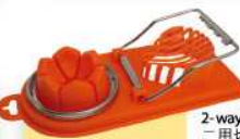
2-way Egg Slicer 二用切蛋器 B-03-100-010-0 19.5 x 9cm