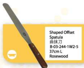
Shaped Offset Spatula 曲抹刀 B-03-244-1W2-5 37cm L Rosewood