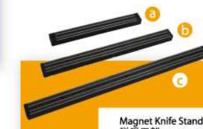
Magnet Knife Stand 磁吸刀架 a B-03-121-000-0 34cm b B-03-121-001-0 47cm c B-03-121-002-0 62cm