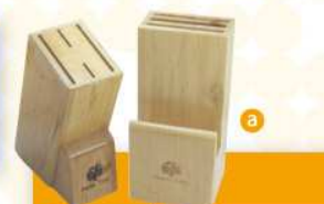
Wooden Knife Stand (Straight) 直身木刀座 a B-03-120-001-H 11 x 10 x 23cm H