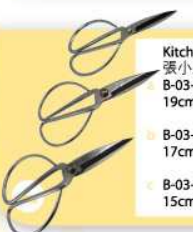
Kitchen Scissors 張小泉白剪 B-03-070-070-0 19cm B-03-070-080-0 17cm B-03-070-090-0 15cm