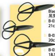
Black Kitchen Scissors 黑剪 B-03-070-040-0 21cm B-03-070-050-0 20cm B-03-070-060-0 18.5cm