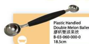
Plastic Handled Double Melon Baller 膠柄雙頭果挖 B-03-060-000-0 18.5cm