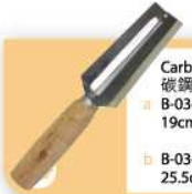
Carbon Steel Peeler 碳鋼瓜削 a B-03-091-050-0 19cm b B-03-091-070-0 25.5cm