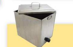
Stainless Steel Electric Disinfection Box 電消毒箱 B-03-201-000-H 38 x 8 x 35.6cm H