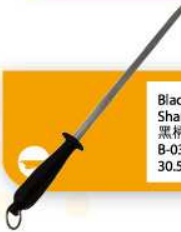
Black Handled Sharpening Steel 黑柄磨刀棍 B-03-190-120-0 30.5cm L