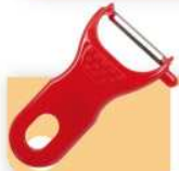
Potato Peeler 日本小號薯仔削 B-03-091-090-H 11.5cm