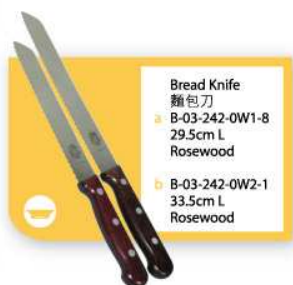
Bread Knife 麵包刀 a B-03-242-0W1-8 29.5cm L Rosewood b B-03-242-0W2-1 33.5cm L Rosewood