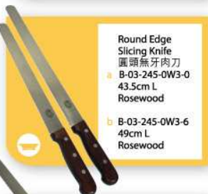
Round Edge Slicing Knife 圓頭無牙肉刀 a B-03-245-0W3-0 43.5cm L Rosewood b B-03-245-0W3-6 49cm L Rosewood