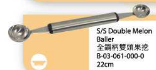
S/S Double Melon Baller 全鋼柄雙頭果挖 B-03-061-000-0 22cm