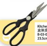
Kitchen Scissors 盒裝廚剪 B-03-070-030-H 23.5cm