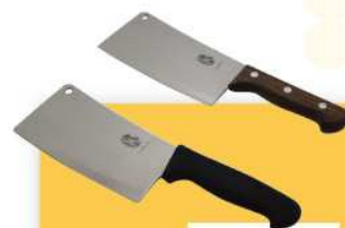
Kitchen Cleaver 砍刀 a B-03-247-0B1-9 9 x 18cm L Black b B-03-247-0W1-8 8 x 19cm L Rosewood