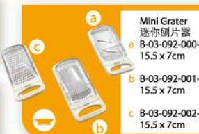
Mini Grater 迷你刨片器 a B-03-092-000-0 15.5 x 7cm b B-03-092-001-0 15.5 x 7cm c B-03-092-002-0 15.5 x 7cm