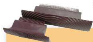
Decorating Pin 木輪棍 B-03-064-100-0 15cm