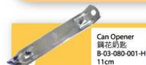
Can Opener 鋼花奶匙 B-03-080-001-H 11cm