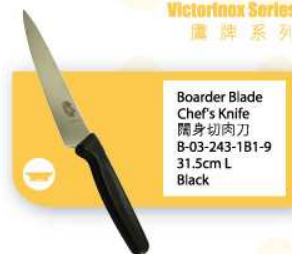
Boarder Blade Chef's Knife 闊身切肉刀 B-03-243-1B1-9 31.5cm L Black