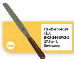
Flexible Spatula 抹刀 B-03-244-0W2-5 37.5cm L Rosewood