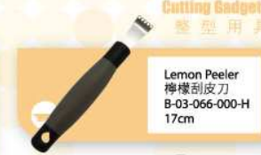
Lemon Peeler 檸檬刮皮刀 B-03-066-000-H 17cm